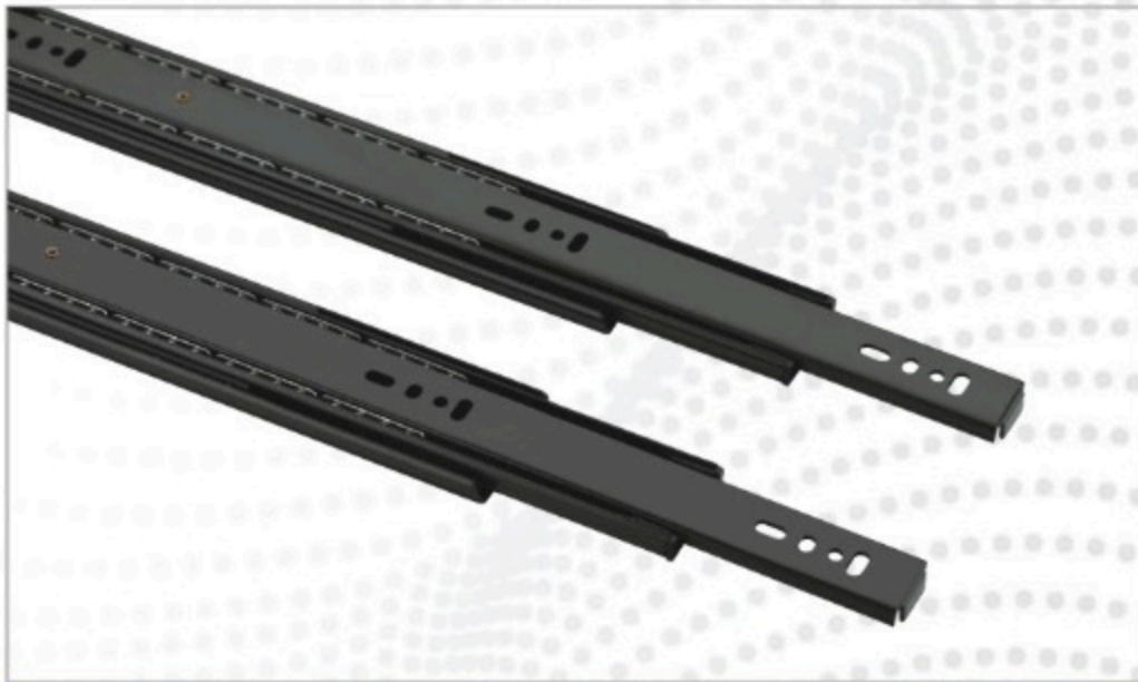
HIGH QUALITY BLACK COATING